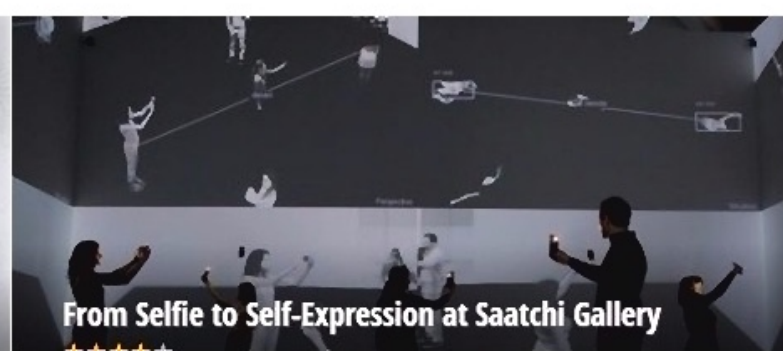
From Selfie to Self-Expression at Saatchi Gallery ★★★★★ Miranda Slade