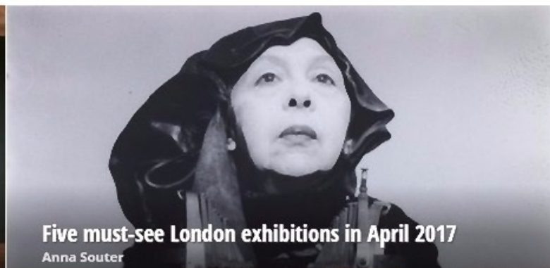
Five must-see London exhibitions in April 2017 Anna Souter