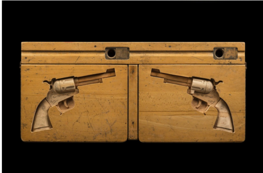
Ben Turnbull 'Natural Born Killers Part I', 2014 StolenSpace Gallery SOLD – £10,000 - 15,000

Turnbull has referred to his work "Angry Pop," because of its use of aggression and violent popular imagery. The title of the show is a pastiche of references, including the 1991 hit rock song by Nirvana, "Smells Like Teen Spirit," and the graphically violent 1998 feature film American History X . Both examine male violence and anger, though from very different perspectives. In Smells Like Teen Spirit #1 (2014), Turnbull has transformed a wooden school desk into a cabinet, with a fake revolver behind a glass pane labeled "IN EMERGENCY BREAK GLASS." Here, the weapon is presented as restricted, but available. When asked about his interest in the gun, Turnbull has said, "It's the forbidden fruit—which is what draws me in. Here in the UK, you can't actually obtain the guns, so I have to hunt them out."