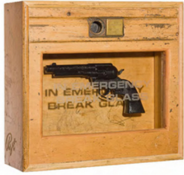
Ben Turnbull 'Smells Like Teen Spirit #1', 2014 StolenSpace Gallery

Turnbull's new works feature in "SMELLS LIKE TEEN SPIRIT" (American History X – Volume II) at London's StolenSpace Gallery this month. The show follows up on his previous solo exhibition at the gallery, "American History X – Volume I – The Death Of America," in which he presented Warhol-like replicas of iconic images from American history, collaged from bits of comic books to depict the nation from the perspective of a contemporary British artist. Turnbull's new sculptures were made by carving guns into the wooden surfaces of vintage school desks.