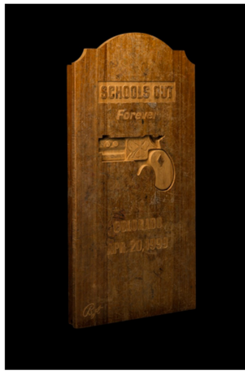
Ben Turnbull 'Schools Out', 2014 StolenSpace Gallery